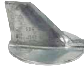
6E5-45371-01 RH Skeg V4