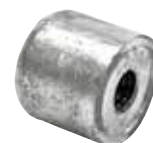
Merc 55989 nut / ram