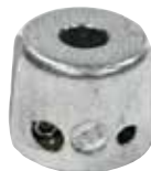
Ice-eater Zinc 1/2"