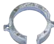
Merc 806188 carrier