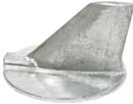
6L6-45371-00 V4 LH skeg