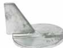
Merc 46399 Offset Trim Tab