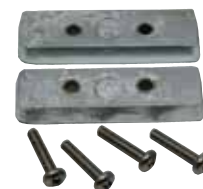
Bennett Trim Tab Kit (Kit contains 2 zincs and bolts)