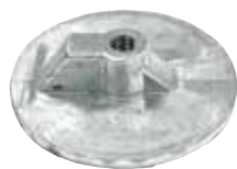
Merc 76214 trim tab