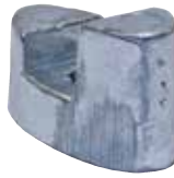
Vetus Bow Thruster SET 0153 BP 129