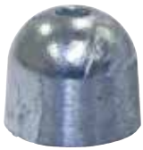
Side-Power Bow Thruster SM201180

All Bow Thruster zincs are individually packaged with mounting screw(s).