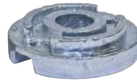
Vetus Bow Thruster SET0150 BP1185