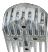
Merc 43994 Alpha zinc