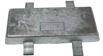
Weld on plate - BSMWO114X6X12