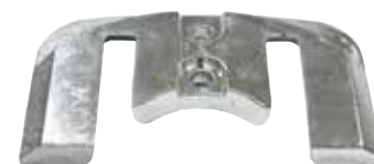
Merc 826130 Bravo plate