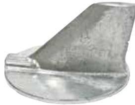
61A-45371-00 V6 skeg