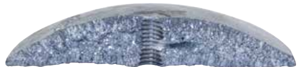
B&S Hand-Poured Zinc with molecular structure maintained.