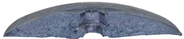
Die Cast Anode with molecular structure altered.