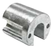
Merc 806190 Bravo I ram