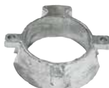
Merc 806105 carrier ring