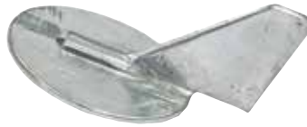
6J9-45371-00 V6 RH Skeg