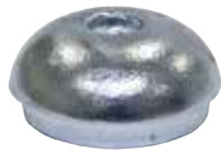
Side-Power Bow Thruster SM51180 (SM71190)