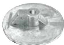
Merc 762144 trim tab