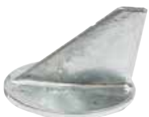
Merc 31640 Trim Tab