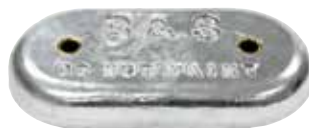
B-12 (Sea Ray) B-6