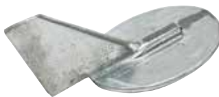
6K1-45371-01 V6 LH skeg